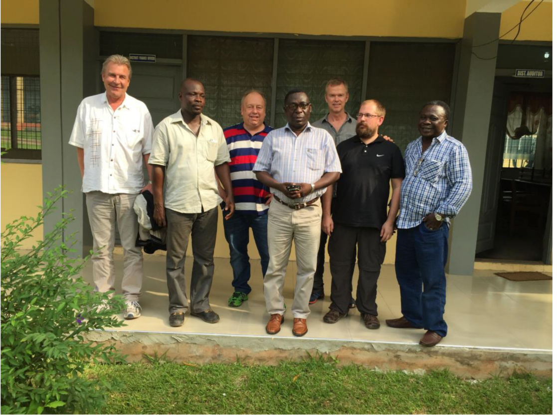
Meeting at the municipality of Asankrangua with Mayor of town council.