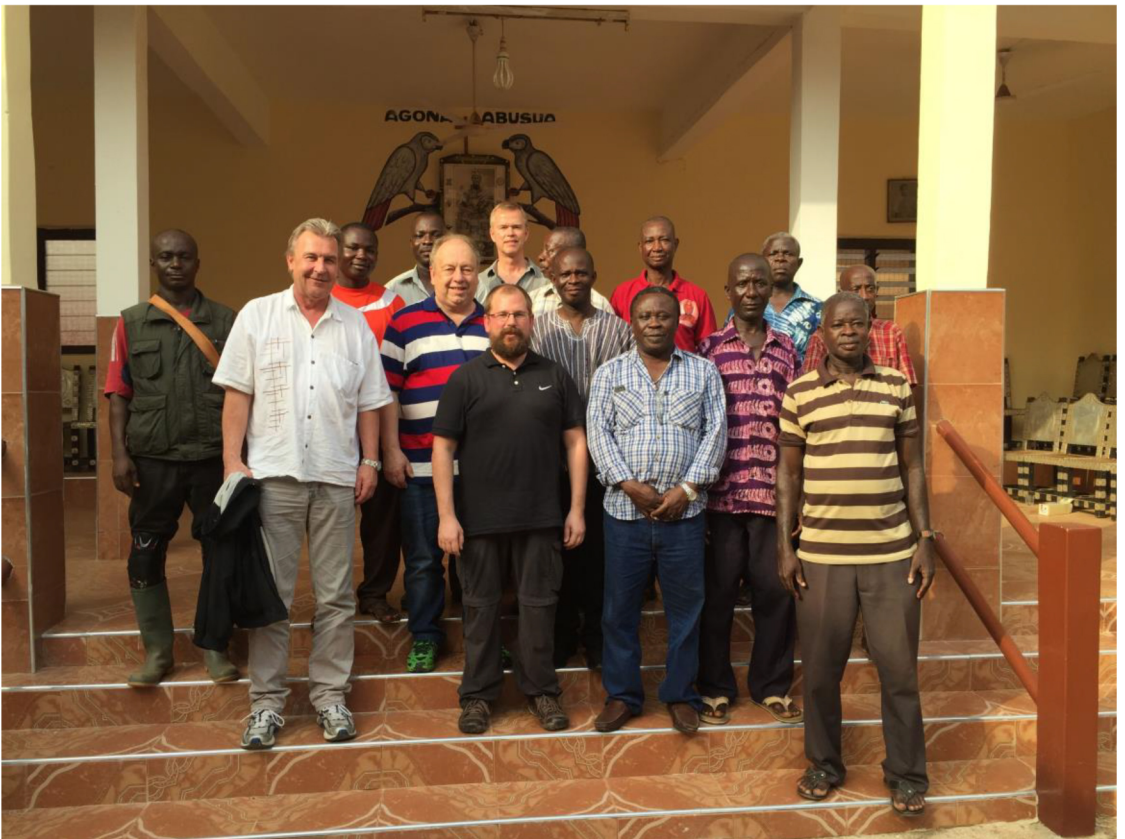
Meeting with traditional leaders in Asankrangua