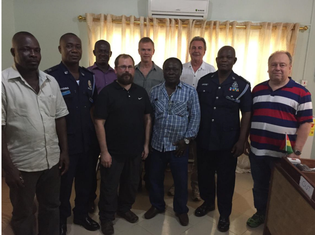
Meeting at local police chief office in Asankrangua

There has been quite a lot of problems with illegal miners on the site for many years. Already since first steps were taken to acquire the concession Afro Scandic had to employ 4 guards at site to protect the concession.